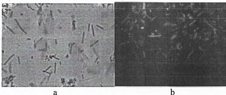
Figure 2. Microscopy of E. coli (x800)

Figure 2 represent microscopic images of E. coli cells, in visible light (a – wild type and transformed cells have the same morphology and characteres) and in UV (b – only transformed cells can be seen).