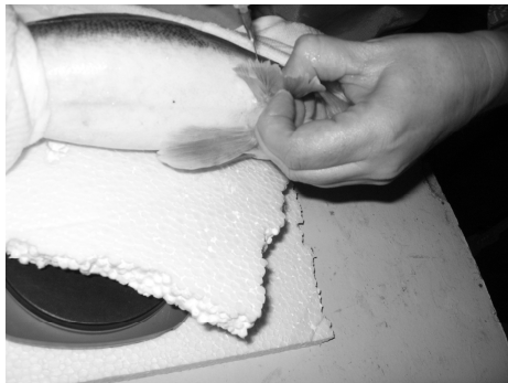
Fig. 1. Intraperitoneal injection of the males

Sixteen clinically healthy adult pikeperch males (3-4 years old) were used in our experiments. They were collected at the beginning of the breeding season of the year 2008, from Ineu Piscicultural Farm and B.H.M Hungary Ltd. (Fonyód, Ungaria). They were kept in the ponds at Banat's University of Agricultural Sciences and Veterinary Medicine from Timisoara until the water temperature reached 10.5°C. Other water parameters in pond were: pH = 8; dH° = 5; O 2 = 11.65 mg/l (104,6%); NO 2 - <0.3 mg/l; NO 3 - = 6 mg/l. Males were then moved into a concrete tank with about 7000 liters of water. The water was recirculated 0.3 times per hour and an aerator device was used to maintain the oxygen level at 7 ppm / liter. The male breeders were kept for 24 hours at a temperature of 11°C and than were randomly splitted in experimental variants. They were intraperitoneal injected at the base of the pelvic fin (fig. 1) with one of the following hormones: human chorionic gonadotropine - hCG (Pregnyl), GnRH analog (Receptal) and carp pituitary extract (CPE). Carp pituitary extract was homogenized in mortar and then dissolved in 0.9% NaCl.