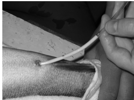
Fig. 2. Milt collection with catheter