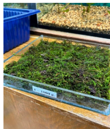
Figure 3. Laying the substrate

The trays were placed in two cabinets (Figure 5) to protect them from possible attacks by mites or black flies. In batch C, we used as feed a paste consisting of cow's milk with 1.5% fat to which wheat flour was added (Table 1). Milk and flour were mixed and boiled for 2 minutes. The obtained product provides 682 kcal/kg, 39 g of crude protein, 14.52 g of crude fat, 98.8 g of carbohydrates and 17.44 g of minerals.