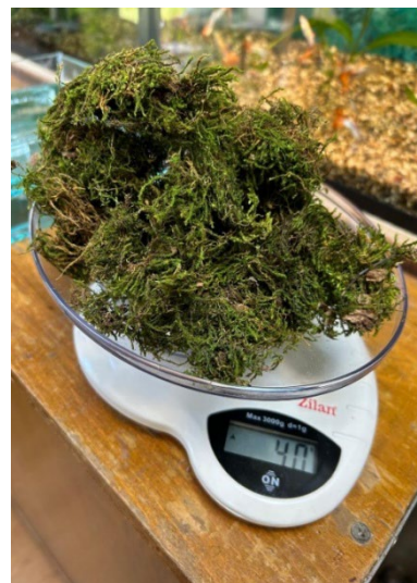
Figure 2. Substrate

coverslip, allowing for easier and impurity-free harvesting. 2 glass covers were placed over the plastic net. After that, for 24 hours, the trays were pressed to facilitate a better levelling of the muscle layer (Figure 4). The volume of the growth substrate, after pressing, was 400 cm 3 (L=20 cm, H=1 cm) ensuring a humidity of 84%. 5 g of Grindal worms were introduced into each tray. The 10-culture media were divided into 2 batches (C vs E), of 5 trays each (C1-C5 and E1-E5 respectively).