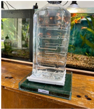
Figure 4. Pressing the layer