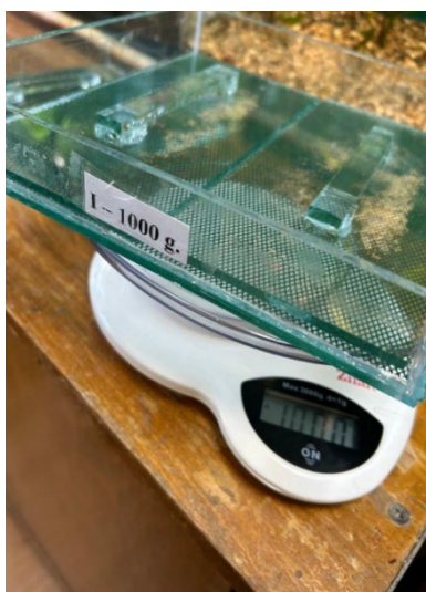
Figure 1. Glass tray

In order to carry out the experiment, we used 10 square glass trays (Figure 1) with sides of 20/20 cm in which we added the substrate for the culture of Grindal worms. The substrate was made of ground moss ( Polytrichum commune ), washed and dried beforehand, in an amount of 40 g, moistened with 200 ml of water (Figure 2).