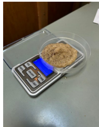
Figure 6. Weighing the worms

table 1. At an interval of 10 days, the trays were drained to remove excess moisture resulting from the administration of wet food and the pH of the substrate was also checked to keep it around 7. We note that from the experience of previous years, the decrease in pH values below the value of 6 leads to a decrease in crop productivity. We corrected the pH with the help of a 50-volume solution of 1% sodium carbonate added over the substrate for 5 minutes followed by the removal of excess moisture by free draining (Figure 7). This procedure was applied three times for all trays in batches C and E in order not to have different effects on the results obtained.