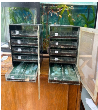
Figure 5. Culture space

table 1. At an interval of 10 days, the trays were drained to remove excess moisture resulting from the administration of wet food and the pH of the substrate was also checked to keep it around 7. We note that from the experience of previous years, the decrease in pH values below the value of 6 leads to a decrease in crop productivity. We corrected the pH with the help of a 50-volume solution of 1% sodium carbonate added over the substrate for 5 minutes followed by the removal of excess moisture by free draining (Figure 7). This procedure was applied three times for all trays in batches C and E in order not to have different effects on the results obtained.